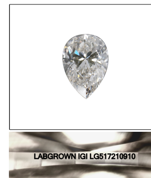
LASERSCRIBE SM Sample Image Used

Red symbols indicate internal characteristics. Green symbols indicate external characteristics.